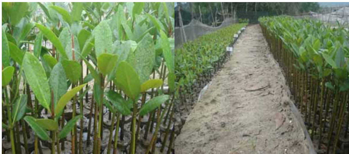
Figure 5: Mangrove and Vet on January 20, 2011

The sexangula ( mắm ) trees were attacked/eaten by rats, this is an unexpected risk and unavoidable during the operation. The reasons can be described as follows: In October 2011, one month and a half after seeding, there was a big flood, submerging the Huong Phong area, only nursery garden remained dry. The rats stay in surrounding ponds and rice fields escaping from their flooded residence to evacuate in nursery (hundreds of rats). The mắm is their favorite. The experts, technical staff and nursery garden staff has intensively taken measures for rats prevention and killing (fence was made, surrounding by nylon, 14 traps were placed, killing more than 60 rats. However, rats attraction of mắm was not controlled. They have completely eaten over 1000 units of this species only for 5 nights.