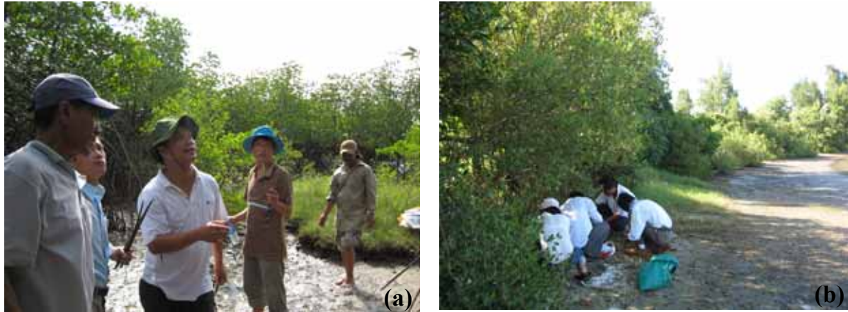
Figure 3. Give technical guidance for seed collection

With the instruction and assistance of experts, mangrove seeds were collected from mangrove carpets in Tan My Commune, Phu Vang District (species including sú , and vẹt ), mangrove forest near Bu Lu river mouth ( đước ); Lang Co, Phu Loc District ( mắm , sú ) (Figure 3).