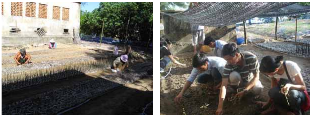
Figure 4. Sowing the mangrove seeds in the nursing garden

All the collected seeds were well protected and moved to the nursing garden for being sowed into the prepared nursing bottles in the following day (Figure 4).