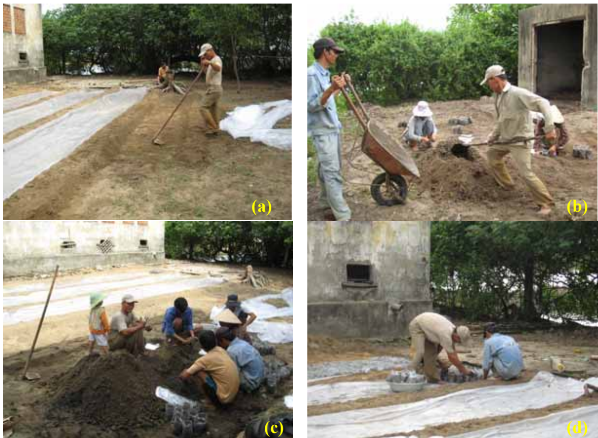
Figure 2. Preparation for nursing garden building (a) leveling and furrowing (b) preparing nursing soil (c) making bottles and (d) aligning bottles into rows

In collaboration with the local labor, 2 labor groups (6 people/group) were convened to commence the work. In four days, they i) leveled the site for building the nursing site; ii) prepared the soil and feces for making the bottles; iii) furrowed and made nursing bottles; iv) established the protection fence (Figure 2).